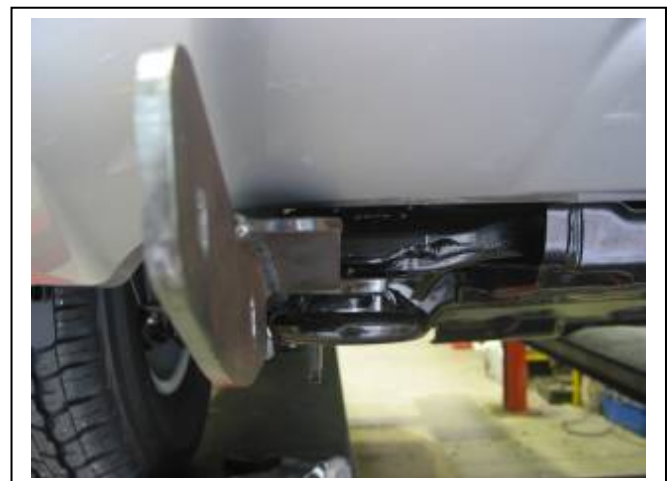
Figure 4: ECB Steel mounting brackets fitted