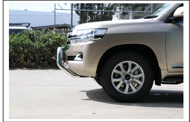
Figure 6: 76mm Nudge Bar side view shown