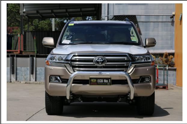
Figure 5: 76mm Nudge Bar front view shown