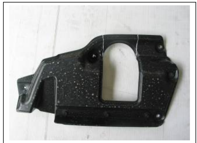
Figure 2: Under body trim cut lines