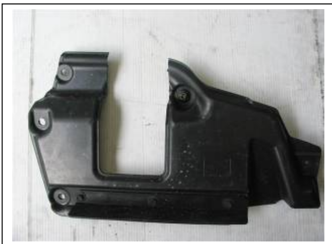
Figure 3: Trimmed under body shields.