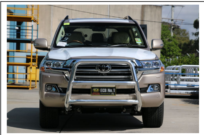
Figure 7: 76mm Series 2 Nudge Bar front view shown