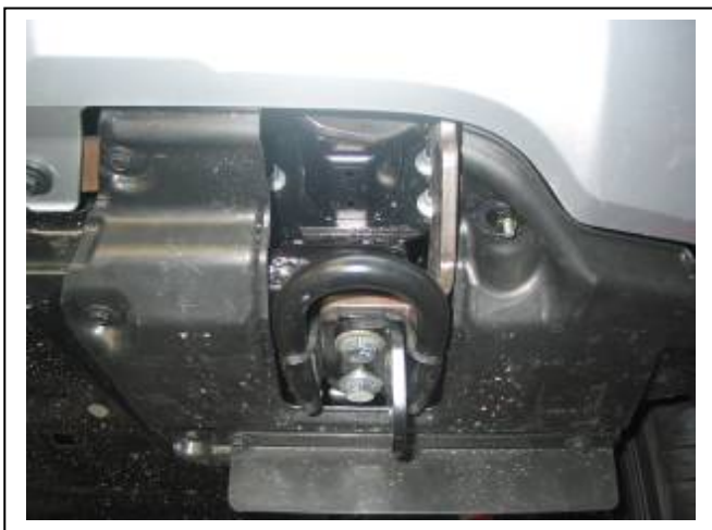
Figure 1: Genuine Tow hooks